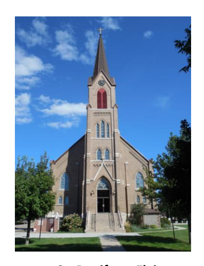
St. Boniface, Elgin SUNDAY 10:00 AM