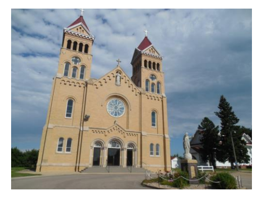
St. Bonaventure, Raeville SUNDAY 8:00 AM