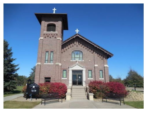
St. Peter, Ewing SATURDAY 5:30 PM