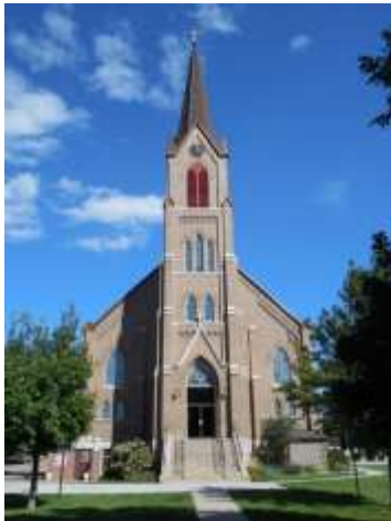
St. Boniface, Elgin SUNDAY 10:00 AM