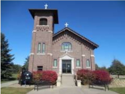
St. Peter, Ewing SATURDAY 5:30 PM