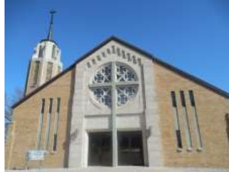
St. John the Baptist, Petersburg SATURDAY 7:00 PM