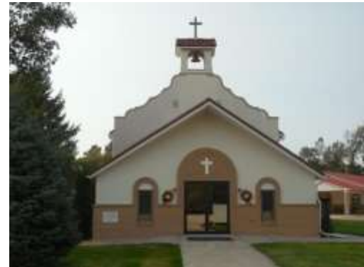
St. John the Baptist, Deloit SUNDAY 11:30 AM