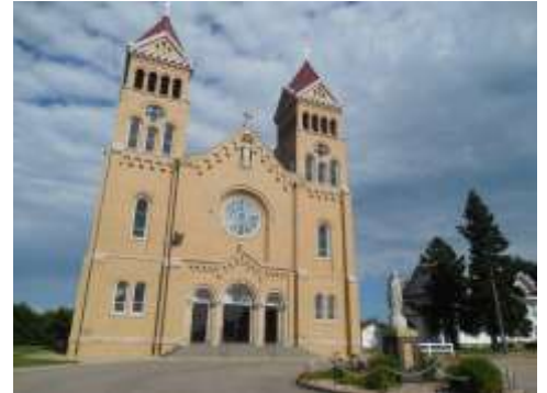
St. Bonaventure, Raeville SUNDAY 8:00 AM