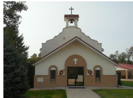
St. John the Baptist, Deloit SUNDAY 11:30 AM