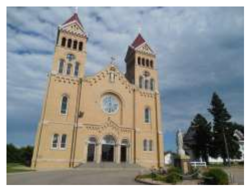
SUNDAY 8:00 AM