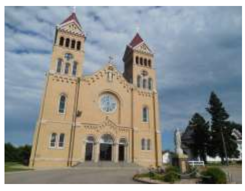
SUNDAY 8:00 AM