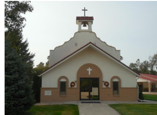
St. John the Baptist, Deloit SUNDAY 11:30 AM