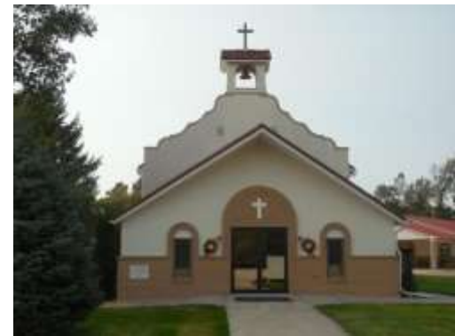
St. John the Baptist, Deloit SUNDAY 11:30 AM