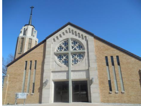
St. John the Baptist, Petersburg SATURDAY 7:00 PM