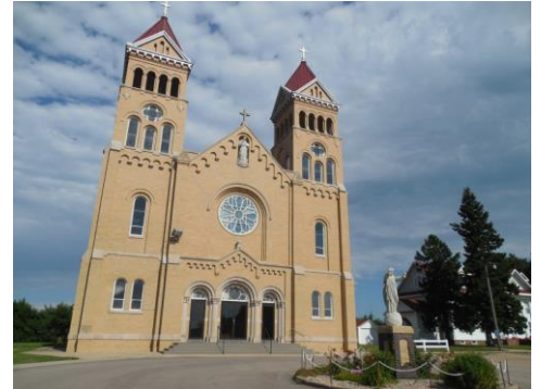
St. Bonaventure, Raville SUNDAY 8:00 AM