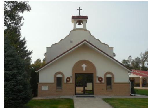
St. John the Baptist, Deloit SUNDAY 11:30 AM