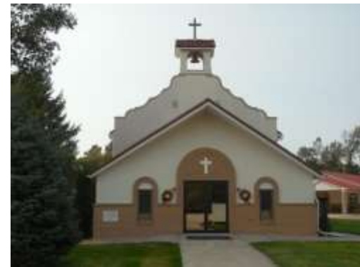
St. John the Baptist, Deloit SUNDAY 11:30 AM