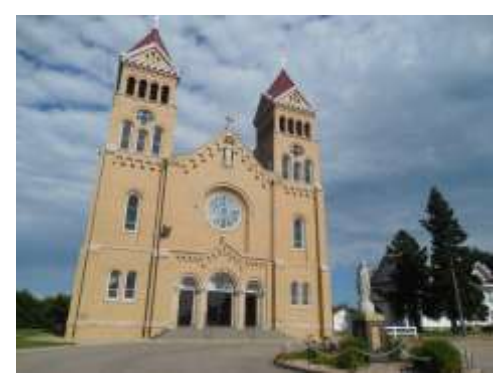
SUNDAY 8:00 AM