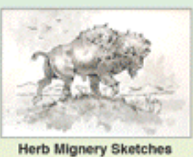
Herb Mignery Sketches