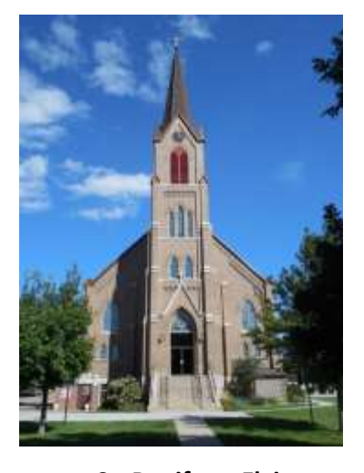
St. Boniface, Elgin SUNDAY 10:00 AM