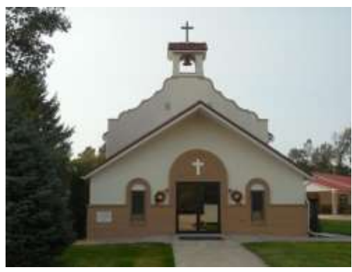
St. John the Baptist, Deloit SUNDAY 11:30 AM

Website: <u>CPPNEBRASKA.OF</u> https://www.facebook.com/cppnebraska