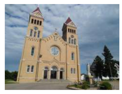
St. Bonaventure, Raeville SUNDAY 8:00 AM