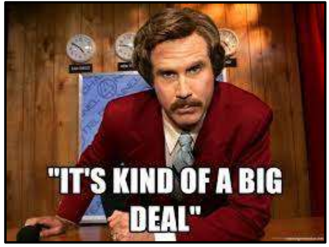
HOLY WEEK... IT'S HERE... LET US WALK WITH CHRIST! This Sunday begins Holy Week. This is by far the most i

This Sunday begins Holy Week. This is by far the most important week of the year. We are invited in our liturgies to walk through this week with Jesus.