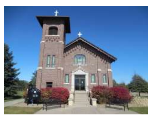
SATURDAY 5:30 PM