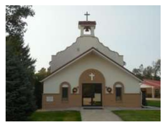
St. John the Baptist, Deloit SUNDAY 11:30 AM

WEBSITE: <u>CPPNEBRASKA.ORG</u> https://www.facebook.com/cppnebraska