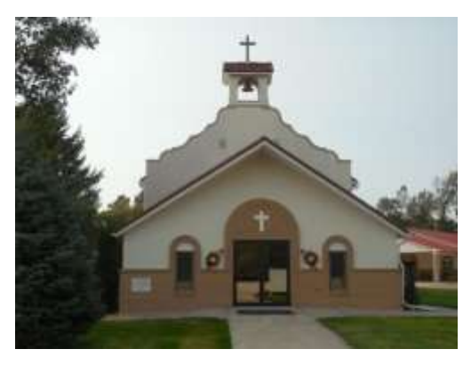
St. John the Baptist, Deloit SUNDAY 11:30 AM

WEBSITE: <u>CPPNEBRASKA.ORG</u> https://www.facebook.com/cppnebraska