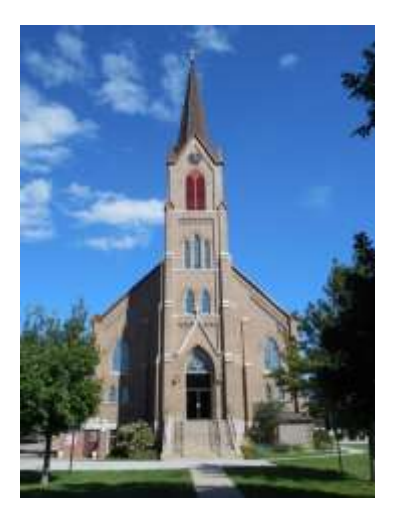
St. Boniface, Elgin SUNDAY 10:00 AM