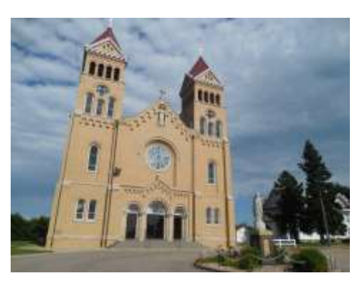
SUNDAY 8:00 AM