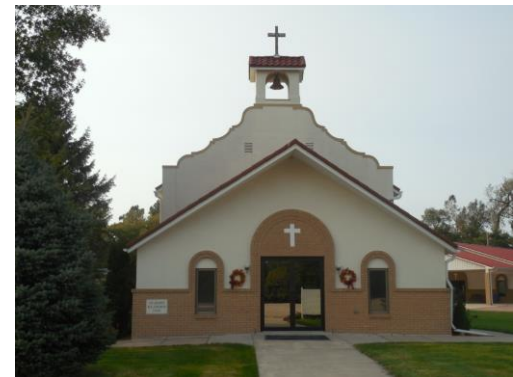
St. John the Baptist, Deloit SUNDAY 11:30 AM