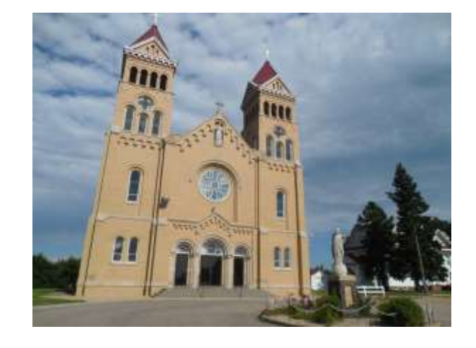
O Sacrament Divine