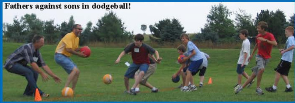
Fathers against sons in dodgeball!

Themes explored this weekend in light of our Catholic faith are our identity as father and son, the father-son bond, becoming a man, communicating from the heart, living our Catholic faith, relating to peers, and vocations as a father and a son: our response to God's call.