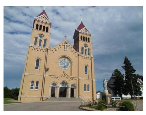
SUNDAY 8:00 AM