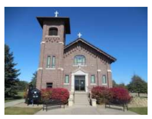
SATURDAY 5:30 PM