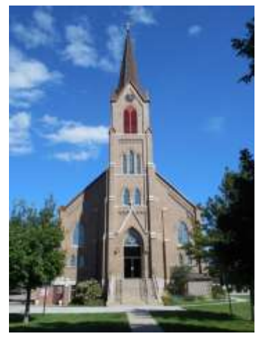
St. Boniface, Elgin SUNDAY 10:00 AM