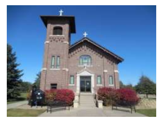
St. Peter, Ewing SATURDAY 5:30 PM