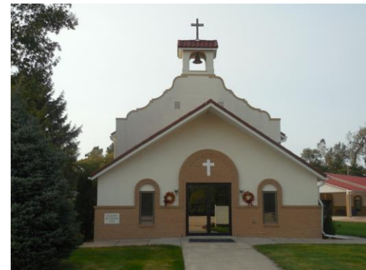
St. John the Baptist, Deloit SUNDAY 11:30 AM