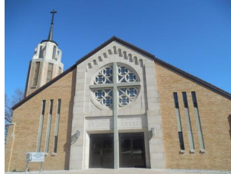
St. John the Baptist, Petersburg SATURDAY 7:00 PM