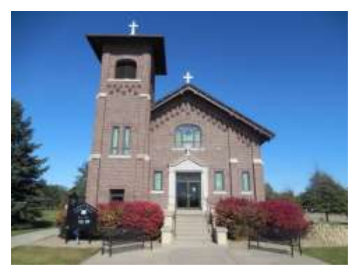
St. Peter, Ewing SATURDAY 5:30 PM