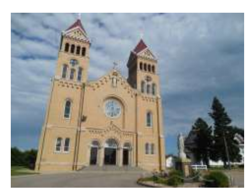
St. Bonaventure, Raeville SUNDAY 8:00 AM