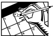
Calendar Items Needed