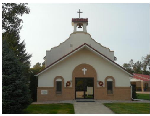
St. John the Baptist, Deloit SUNDAY 11:30 AM