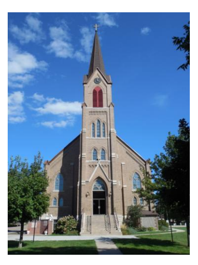
St. Boniface, Elgin SUNDAY 10:00 AM