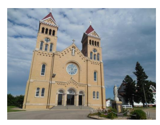
St. Bonaventure, Raeville SUNDAY 8:00 AM