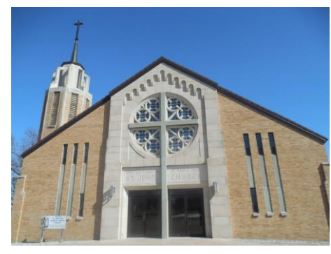
St. John the Baptist, Petersburg SATURDAY 7:00 PM