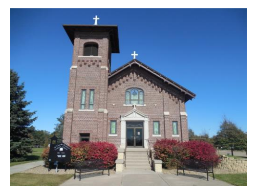
St. Peter, Ewing SATURDAY 5:30 PM