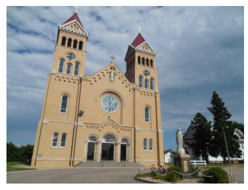
SUNDAY 8:00 AM