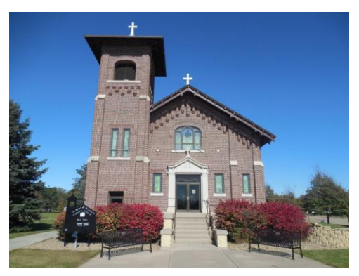
SATURDAY 5:30 PM