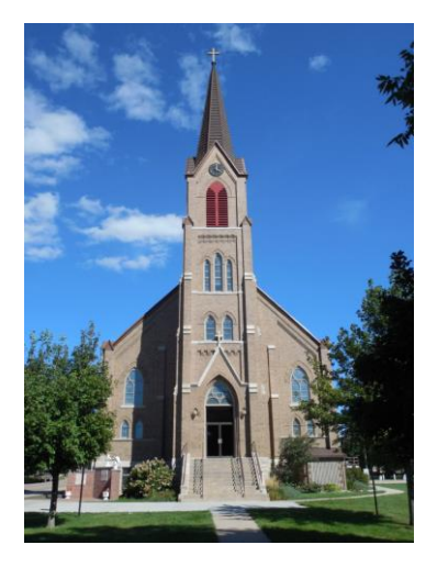
SUNDAY 10:00 AM