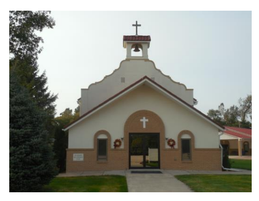
St. John the Baptist, Deloit SUNDAY 11:30 AM

WEBSITE: <u>CPPNEBRASKA.ORG</u> https://www.facebook.com/cppnebraska