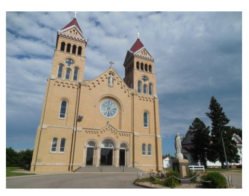
SUNDAY 8:00 AM