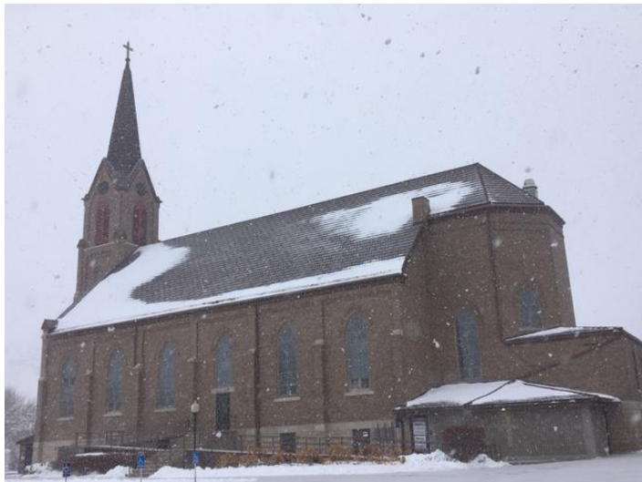
St. Boniface Church, Thanksgiving Day, November 28, 2019