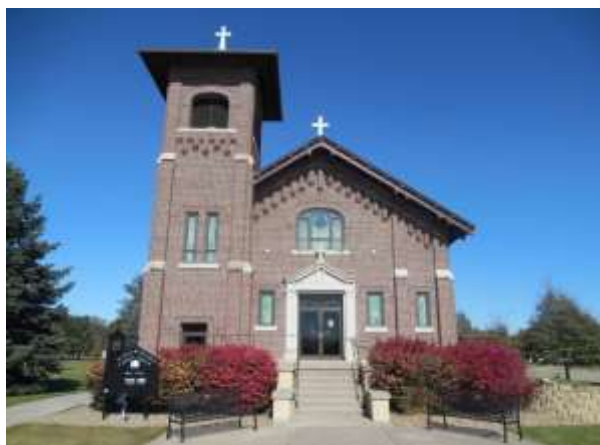
St. Peter de Alcantara, Ewing