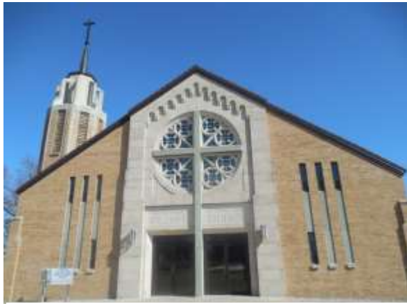
St. John the Baptist, Petersburg