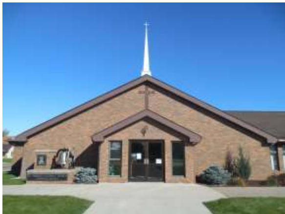
St. Theresa of Avila, Clearwater