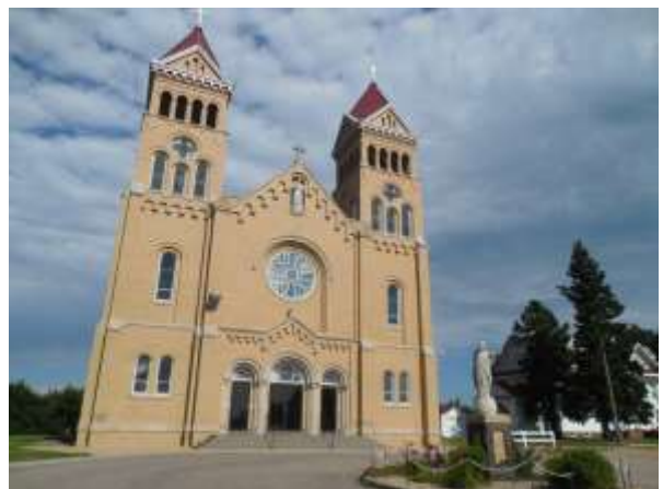
St. Bonaventure, Raeville