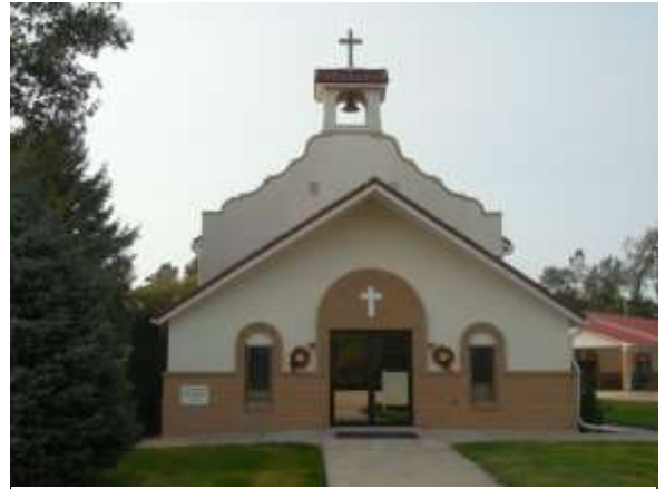
St. John the Baptist, Deloit