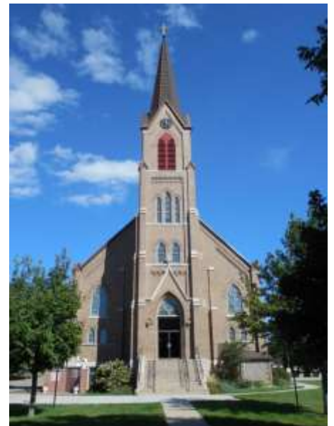
St. Boniface, Elgin