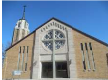
St. John the Baptist, Petersburg SATURDAY 7:00 PM