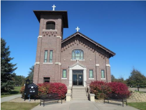
St. Peter, Ewing SATURDAY 5:30 PM