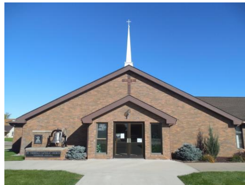
St. Theresa, Clearwater SUNDAY 10:00 AM