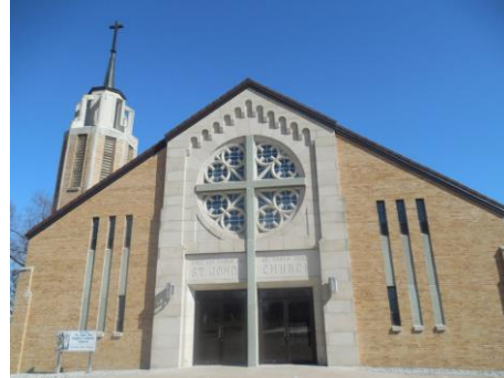
St. John the Baptist, Petersburg SATURDAY 7:00 PM