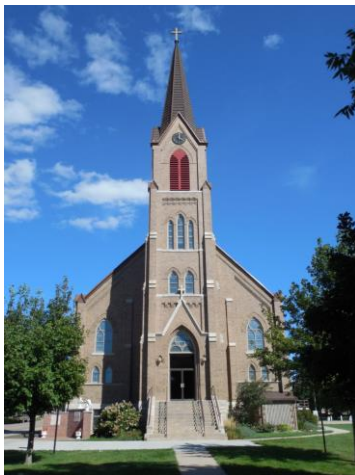
St. Boniface, Elgin SUNDAY 10:00 AM