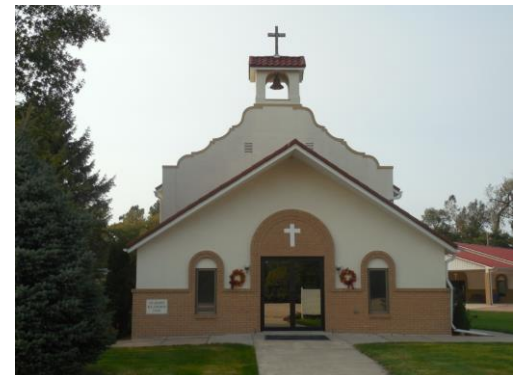
St. John the Baptist, Deloit SUNDAY 11:30 AM