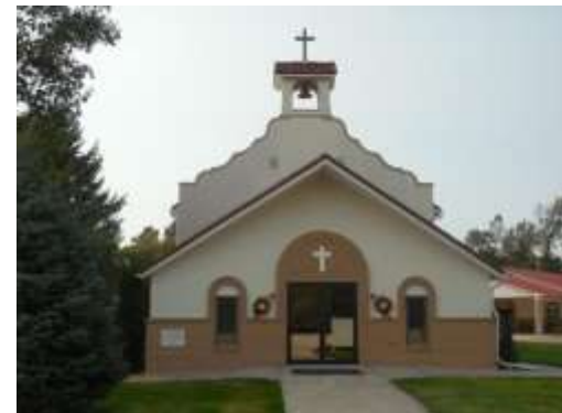
St. John the Baptist, Deloit SUNDAY 11:30 AM