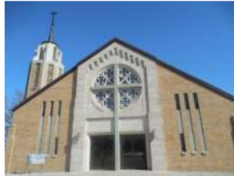
St. John the Baptist, Petersburg SATURDAY 7:00 PM