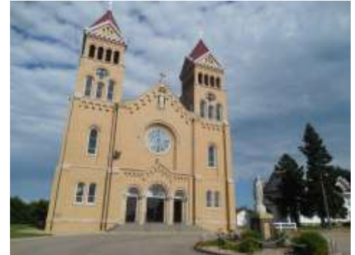
St. Bonaventure, Raeville SUNDAY 8:00 AM