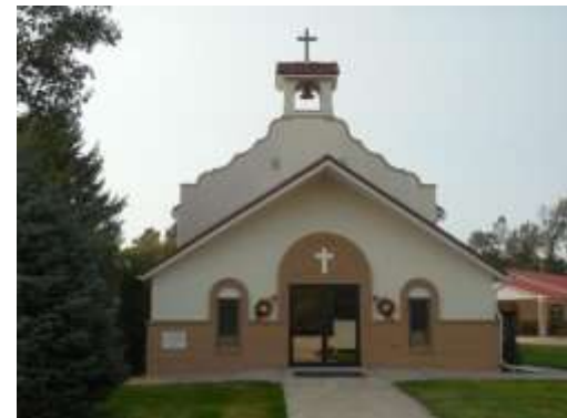
St. John the Baptist, Deloit SUNDAY 11:30 AM