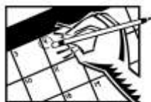
Calendar Items Needed

Does your parish have upcoming fundraisers? Call the Elgin Office 843-2345 or by emailing parish@cppnebraska.org .