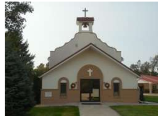
St. John the Baptist, Deloit SUNDAY 11:30 AM