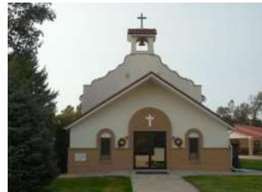
St. John the Baptist, Deloit SUNDAY 11:30 AM