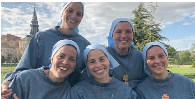
Five Biological sisters who joined the religious life in just two years!!

Seminarian will cook their own country's traditional food, sing and dance their country's funny music. It is really interesting and joy.