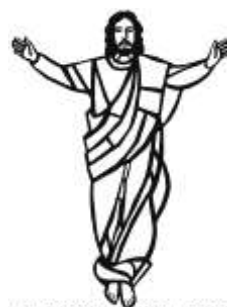
He ascended into heaven

"I am the Alpha and the Omega, the first and the last, the beginning and the end." (REVELATIONS 22:13)