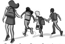
Pray for Our Students

"God of wisdom and might, we praise you for the wonder of our being, for mind, body, and spirit. Be with our children as they begin a new school year. Bless them and their teachers and staff. Give