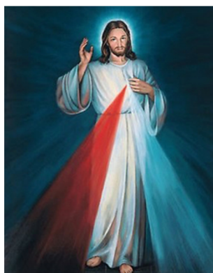
Jesus I trust in you

Former Member of the Holy See's International Theological Commission