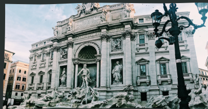
TREVI FOUNTAIN PIAZZA NAVONA ANCIENT ROME