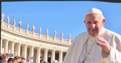
PAPAL AUDIENCE WITH POPE FRANCIS