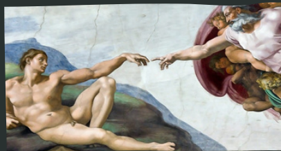
VATICAN MUSEUMS WITH THE SISTINE CHAPEL